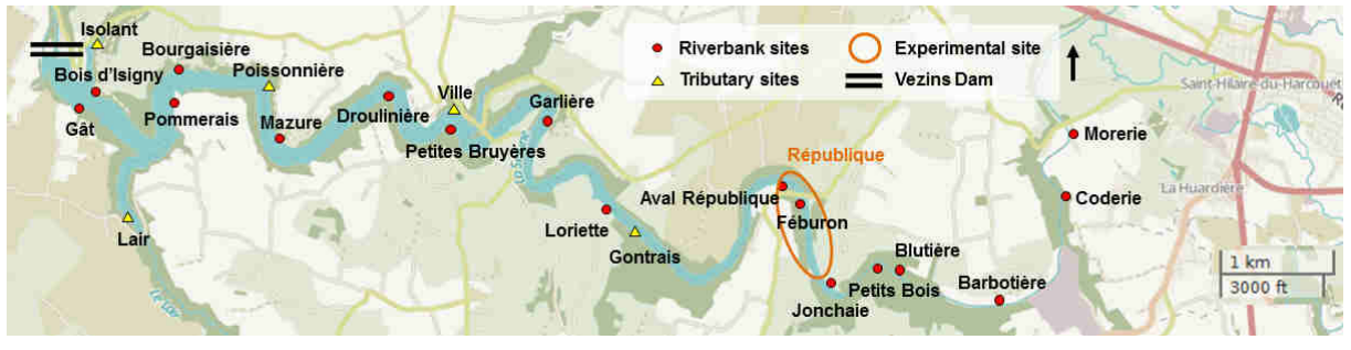
Fig. 1. Location of the 22 sites along the Vezins impoundment

The vegetation survey sampling, conducted between 2015 and 2017, is based on observations of spontaneous vegetation community colonizing alluvial deposits at two scales (impoundment/ experimental site). We considered 22 sites spread across the reservoir depending on their lateral and longitudinal position (top/bottom of the riverbanks, upstream/downstream, tributaries' mouths/Sélune's banks, rework/undisturbed areas,) and, in another hand, focused on the République Bridge experimental site (Fig. 1). 13 sites were sampled in March, June and September 2015; 18 in September 2017. The République Bridge site was sampled in March, May and July 2015 and in July 2016 and 2017.