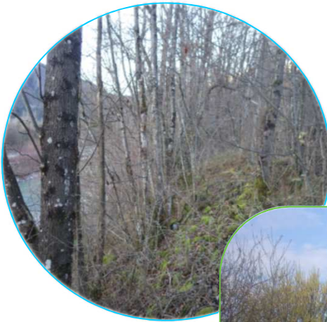
Unmanaged vegetation colonization on dike